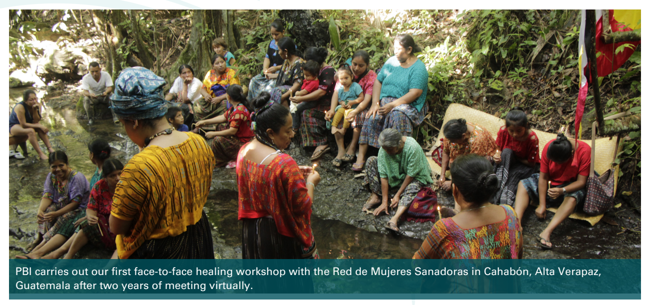
"I am very grateful for the healing space between WHRDs facilitated by PBI. I feel it is very necessary because we suffer from many security incidents."